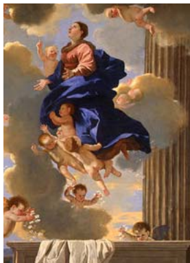
Assumption of Mary August 15th

Franciscan Sisters of St. Paul, MN Vocation Office 1388 Prior Avenue South Saint Paul, MN 55116-2659